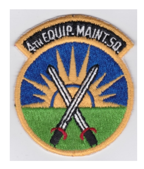
4 Equipment Maintenance Squadron