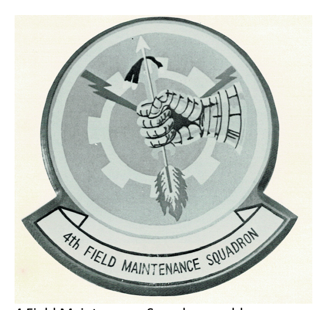
4 Field Maintenance Squadron emblem